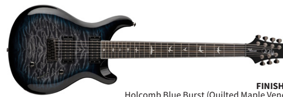
FINISHES: Holcomb Blue Burst (Quilted Maple Veneer)

Maple top with flame maple veneer, shallow violin carve, mahogany back, 25" scale length, 22 fret mahogany neck, rosewood fretboard, bird inlays, PRS stoptail with brass inserts, TCI "S" treble and bass pickups, volume & tone controls with 3-way toggle pickup switch & two mini toggle coil-split switches, PRS-Designed tuners, nickel hardware, gig bag