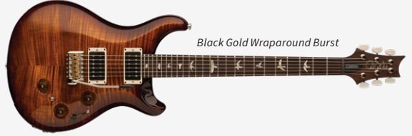
Black Gold Wraparound Burst

MAPLE TOP FINISHES FOR MODELS ABOVE, *INDICATES OPAQUE TOP (NATURAL BACK) Antique White Top*, Black Top*, Black Gold Wraparound Burst, Carroll Blue, Charcoal, Charcoal Burst, Cobalt Smokeburst, Dark Cherry Burst, Faded Whale Blue, Fire Smokeburst, Gray Black, Purple Mist, Yellow Tiger