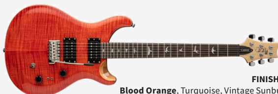
FINISHES: Blood Orange , Turquoise, Vintage Sunburst