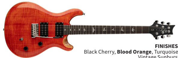
FINISHES: Black Cherry, Blood Orange , Turquoise, Vintage Sunburst