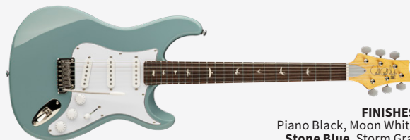
FINISHES: Piano Black, Moon White, Stone Blue, Storm Gray

Poplar body, 25.5" scale length, 22 fret maple neck, maple fretboard, small bird inlays, PRS 2-point steel tremolo, 635JM "S" treble, middle, and bass single-coil pickups, one volume & two tone controls with 5-way blade pickup switch, vintage-style tuners, nickel hardware, gig bag