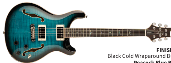
FINISHES: Black Gold Wraparound Burst, Peacock Blue Burst