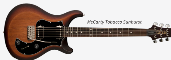
McCarty Tobacco Sunburst

Asymmetric bevel-cut mahogany body, 25" scale length, 22 fret mahogany neck, rosewood fretboard, dot inlays, satin nitrocellulose finish, PRS patented tremolo, 58/15 LT "S" treble and bass pickups, volume & push/pull tone controls with 3-way blade pickup switch, PRS low mass locking tuners, nickel hardware, pickguard, gig bag • Neck profile: Pattern Regular