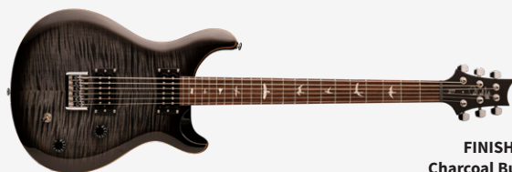
FINISHES: Charcoal Burst