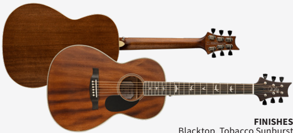
FINISHES: Blacktop, Tobacco Sunburst, Vintage Mahogany

PRS hybrid “X”/Classical bracing, solid mahogany top, Crème/herringbone binding and rosette, mahogany back and sides, 24.72” scale length, 20 fret wide fat mahogany neck, ebony fretboard, bird inlays, ebony bridge, bone nut & saddle, vintage-style tuners, gig bag • Body Depth at Neck Block: 3 15/32” • Body Depth at Tail Block: 3 7/8” • String Spacing: 2 7/32” • Electronics: PRS-Voiced Fishman Sonitone with sound hole mounted volume & tone controls