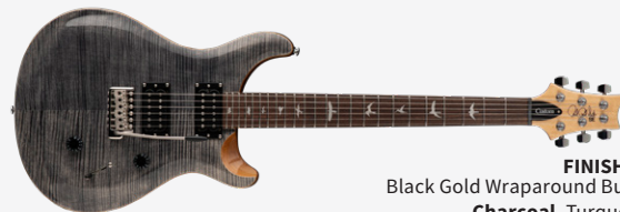
FINISHES: Black Gold Wraparound Burst, Charcoal , Turquoise