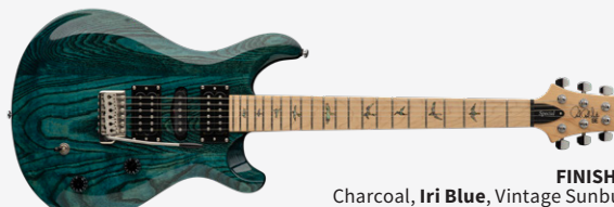
FINISHES: Charcoal, Iri Blue , Vintage Sunburst