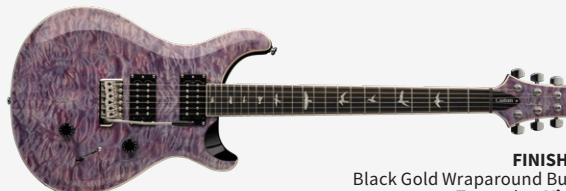
FINISHES: Black Gold Wraparound Burst, Turquoise, Violet