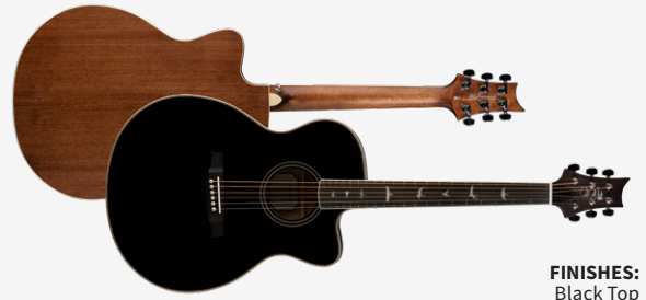
FINISHES: Black Top