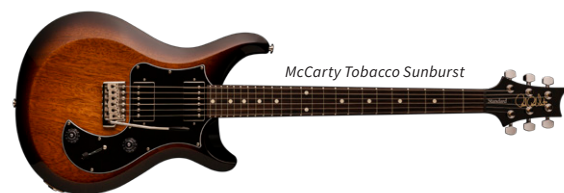
McCarty Tobacco Sunburst

Asymmetric bevel-cut mahogany body, 25" scale length, 24 fret mahogany neck, rosewood fretboard, dot inlays, PRS patented tremolo, 58/15 LT "S" treble and bass pickups, volume & push/pull tone controls with 3-way blade pickup switch, PRS low mass locking tuners, nickel hardware, pickguard, gig bag • Neck profile: Pattern Thin