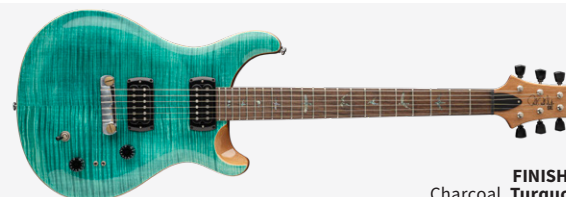
FINISHES: Charcoal, Turquoise

Maple veneer (McCarty Tobacco) or maple top (Gold Top), shallow violin carve, mahogany back, 25" scale length, 22 fret mahogany neck, rosewood fretboard, PRS patented tremolo, DGT "S" treble and bass pickups, two volume & one tone control with 3-way toggle pickup switch, PRS-Designed tuners, nickel hardware, gig bag