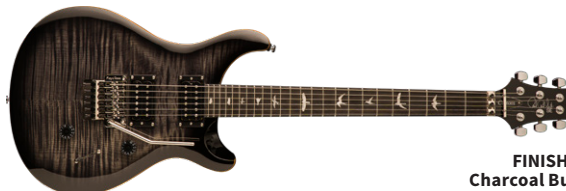
FINISHES: Charcoal Burst