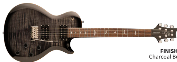
FINISHES: Charcoal Burst

Maple top with single F-hole and flame maple veneer, shallow violin carve, mahogany back, 24.594" scale length, 22 fret bound mahogany neck with satin finish, flame maple bound headstock veneer, bound rosewood fretboard, bird inlays, PRS adjustable stoptail, 245 "S" treble and bass pickups, volume & tone controls for each pickup with 3-way toggle pickup switch on upper bout, vintage-style tuners, nickel hardware, gig bag