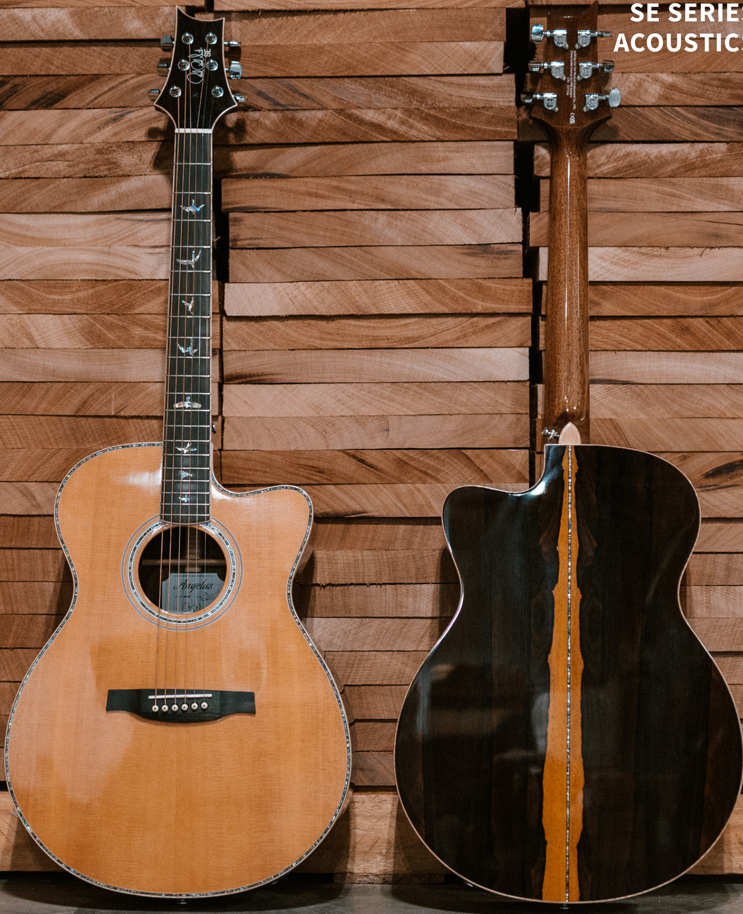
SE A60E // Black Gold