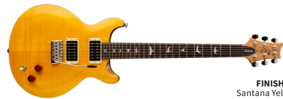
FINISHES: Santana Yellow

Maple top with quilted maple veneer, shallow violin carve, mahogany back, 25.5" scale length, 24 fret bound maple neck with satin finish, ebony fretboard, bird inlays, plate style bridge (string through), Seymour Duncan Holcomb "Scarlet and Scourge" treble and bass pickups, volume & push/pull tone controls with 3-way blade pickup switch, PRS-Designed tuners, black chrome hardware, gig bag (Ships Tuned to Drop C)