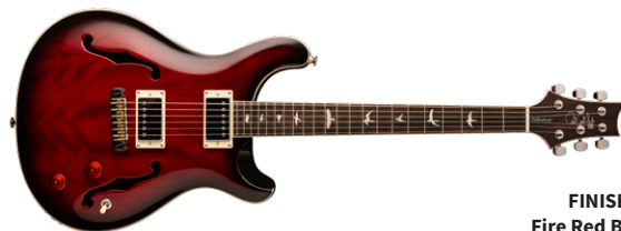
FINISHES: Fire Red Burst

5-ply laminated bound mahogany top and back, mahogany middle, 25" scale length, 22 fret bound mahogany neck, ebony fretboard, bird inlays, PRS adjustable piezo stoptail, 58/15 LT "S" treble and bass pickups, magnetic volume, piezo volume, and tone control with 3-way toggle pickup selector, PRS-Designed tuners, nickel hardware, hardshell case