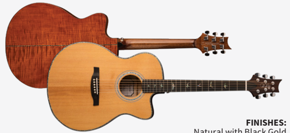
FINISHES: Natural with Black Gold