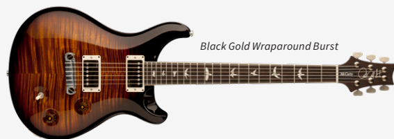
Black Gold Wraparound Burst