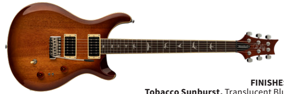
FINISHES: Tobacco Sunburst, Translucent Blue