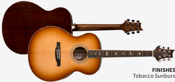
FINISHES: Tobacco Sunburst

PRS hybrid “X”/Classical bracing, solid sitka spruce top, cream body binding, tiger acrylic body purfling, cream/tiger acrylic/black rosette, ovankol back and sides, 25.3” scale length, 20 fret wide fat mahogany neck, ebony fretboard, bird inlays, ebony bridge, bone nut & saddle, PRS-Designed tuners, hardshell case • Body Depth at Neck Block: 3 19/32” • Body Depth at Tail Block: 4 3/8” • String Spacing: 2 7/32” • Electronics: PRS-Voiced Fishman Sonitone with sound hole mounted volume & tone controls