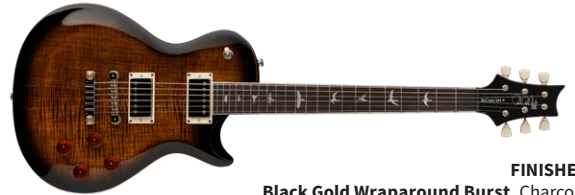
FINISHES: Black Gold Wraparound Burst, Charcoal, Turquoise, Vintage Sunburst

Maple top with flame maple veneer, shallow violin carve, mahogany back, 24.594" scale length, 22 fret bound mahogany neck, rosewood fretboard, bird inlays, PRS two-piece bridge, 58/15 LT "S" treble and bass pickups, volume & tone controls for each pickup with 3-way toggle pickup switch on upper bout, vintage-style tuners, nickel hardware, gig bag