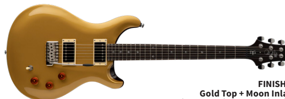
FINISHES: Gold Top + Moon Inlays, McCarty Tobacco Sunburst + Birds Inlays