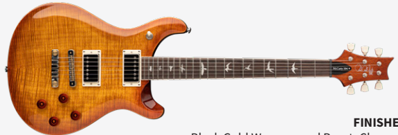
FINISHES: Black Gold Wraparound Burst, Charcoal, Turquoise, Vintage Sunburst