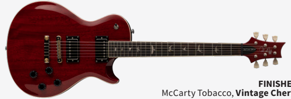
FINISHES: McCarty Tobacco, Vintage Cherry

Maple top with flame maple veneer, shallow violin carve, mahogany back, 24.594" scale length, 22 fret bound mahogany neck, rosewood fretboard, bird inlays, PRS two-piece bridge, 58/15 LT "S" treble and bass pickups, volume & tone controls for each pickup with 3-way toggle pickup switch on upper bout, vintage-style tuners, nickel hardware, gig bag