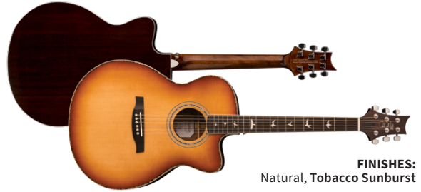
FINISHES: Natural, Tobacco Sunburst