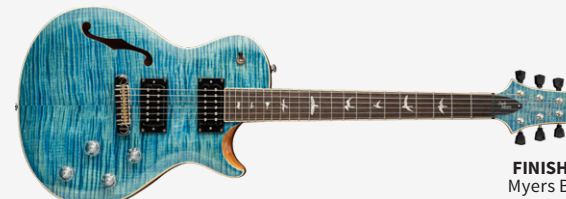
FINISHES: Myers Blue

Beveled maple top with flame maple veneer, mahogany back, 24.5" scale length, 24 fret mahogany neck, rosewood fretboard, bird inlays, PRS patented tremolo, Santana "S" pickups, volume & tone controls with 3-way toggle pickup switch, PRS-Designed tuners, nickel hardware, gig bag