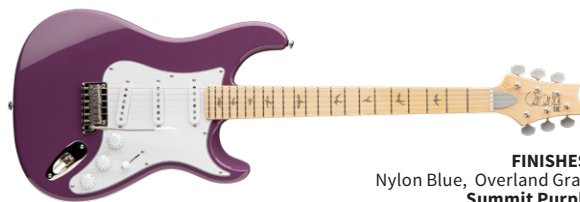
FINISHES: Nylon Blue, Overland Gray, Summit Purple