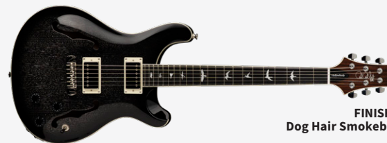
FINISHES: Dog Hair Smokeburst

5-ply laminated maple top and back with flame maple veneers, mahogany middle, 25" scale length, 22 fret bound mahogany neck, ebony fretboard, bird inlays, PRS adjustable piezo stoptail, 58/15 LT "S" treble and bass pickups, magnetic volume, piezo volume, and tone control with 3-way toggle pickup selector, PRS-Designed tuners, nickel hardware, hardshell case