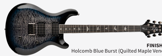
FINISHES: Holcomb Blue Burst (Quilted Maple Veneer)

Maple top with quilted maple veneer, shallow violin carve, mahogany back, 26.5" scale length, 24 fret bound maple neck with satin finish, ebony fretboard, bird inlays, plate style bridge (string through), Seymour Duncan Holcomb "Scarlet and Scourge" treble and bass pickups, volume & push/pull tone controls with 3-way blade pickup switch, PRS-Designed tuners, black hardware, gig bag