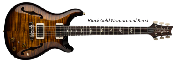
Black Gold Wraparound Burst

MAPLE TOP FINISHES FOR MODELS ABOVE, *INDICATES OPAQUE TOP (NATURAL BACK) Antique White Top*, Black Top*, Gold Top*, Black Gold Wraparound Burst, Charcoal, Charcoal Burst, Dark Cherry Burst, Faded Blue Jean, Fire Red Burst, Gray Black, McCarty Sunburst, McCarty Tobacco Sunburst, Red Tiger, Yellow Tiger