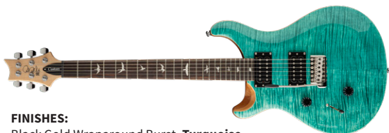
FINISHES: Black Gold Wraparound Burst, Turquoise